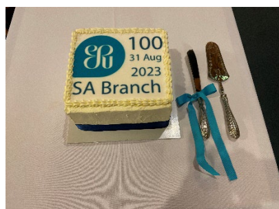
Shown above is the anniversary cake that guests enjoyed at the fine dinner organised by the ESU South Australia branch as part of its centenary events.